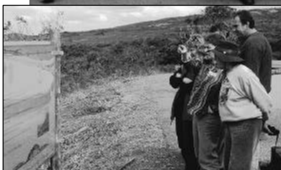
Above: Learning of King George Sound exploration, on Vancouver Road above Frenchmans Bay. Right: A conference busload on Brown's collecting locality at Stony Hill, west of Bald Head.