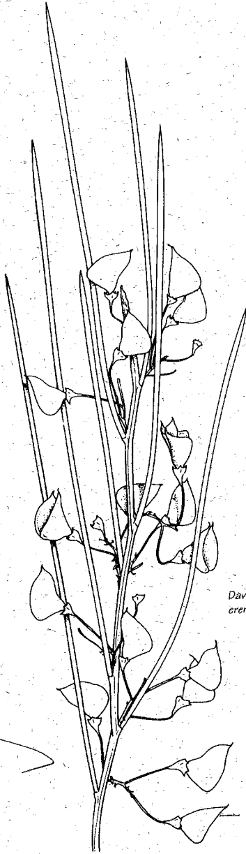
Daviesia cremata Crisp