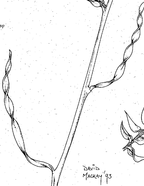
Daviesia nova-anglica Crisp