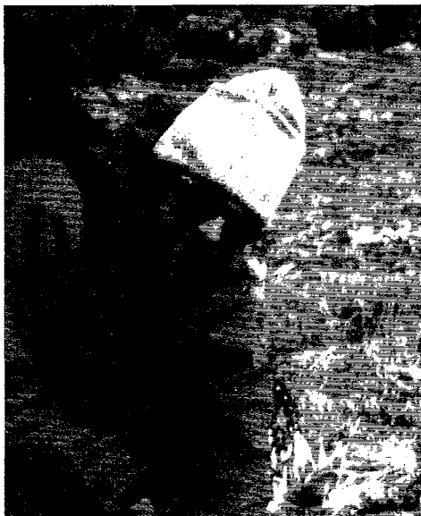
A Yowie or a Feral Botanist? Answer next issue.